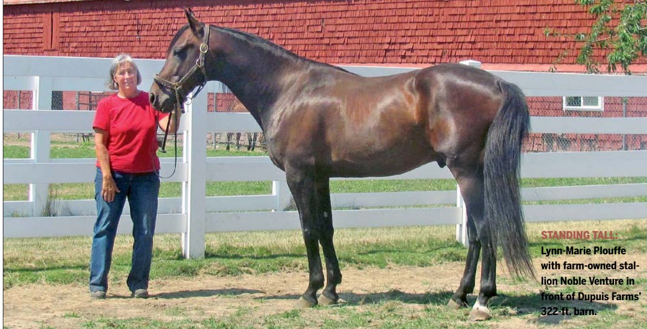
STANDING TALL: Lynn-Marie Plouffe with farm-owned stallion Noble Venture in front of Dupuis Farms' 322-ft. barn.

Father/daughter team builds a Maine breeding landmark